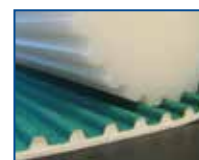
Low friction fabric on toothed side